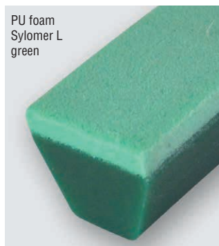
PU foam Sylomer L green