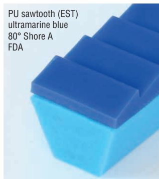
PU sawtooth (EST) ultramarine blue 80° Shore A FDA