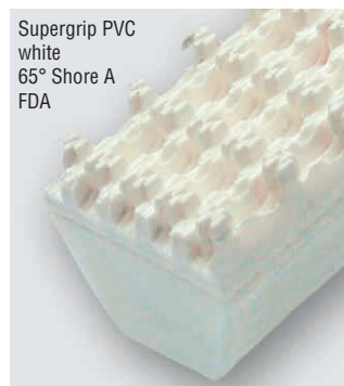
Supergrip PVC white 65° Shore A FDA