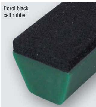
Porol black cell rubber