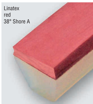
Linatex red 38° Shore A