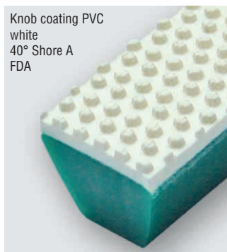
Knob coating PVC white 40° Shore A FDA