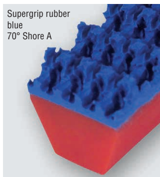
Supergrip rubber blue 70° Shore A