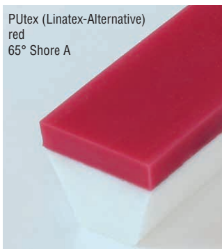
PUTex (Linatex-Alternative) red 65° Shore A

Coatings on V-belts allow to achieve target material properties, e.g. better grip, accumulation or release on a durable base belt. BEHA offers various coating materials, hence we can design belts with optimal features for your application. The "PUTex" coating is for example THE alternative to Linatex (rubber).