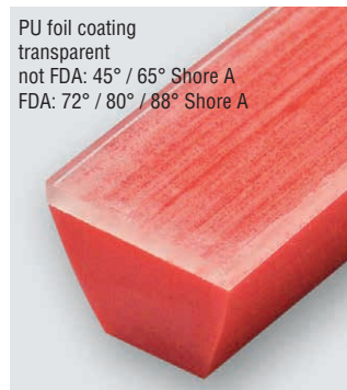
PU foil coating transparent not FDA: 45° / 65° Shore A FDA: 72° / 80° / 88° Shore A