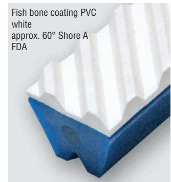
Fish bone coating PVC white approx. 60° Shore A FDA