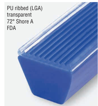
PU ribbed (LGA) transparent 72° Shore A FDA