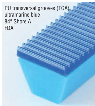
PU transversal grooves (TGA) ultramarine blue 84° Shore A FDA