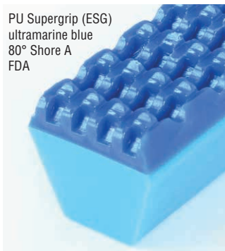
PU Supergrip (ESG) ultramarine blue 80° Shore A FDA