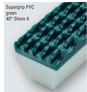
Supergrip PVC green 40° Shore A