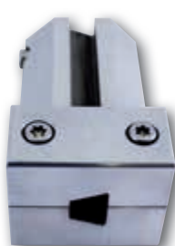
Profile adapter for V-belts