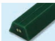
After overlap welding