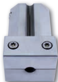
Profile adapter for round belts

Profile adapters for special profiles on request