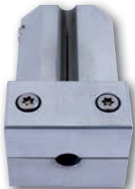
Profile adapter for round belts