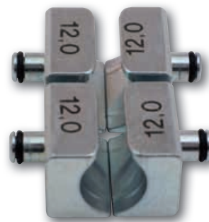
for round belts