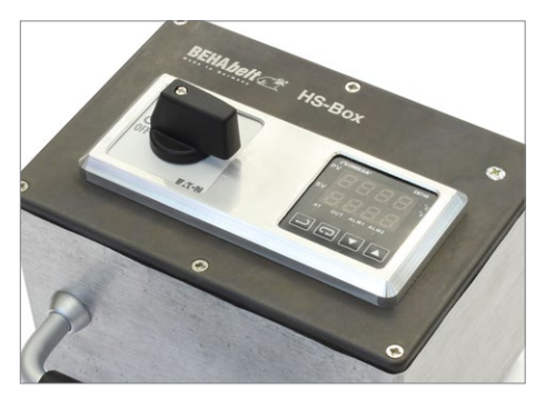
Robust and easy to use control unit for temperature control