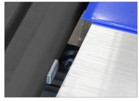
Welding stop for repeatable welds