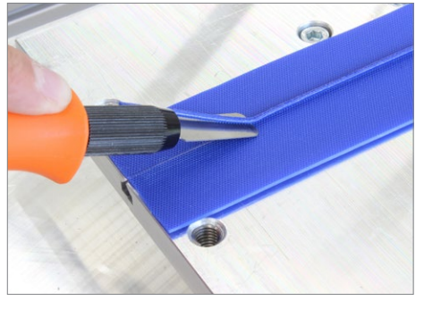
Easy removal of the welding bead with the supplied tool