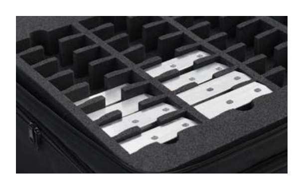
In the upper part of the transport bag there is a generally usable space for the side cutter SE02 and free compartments for 9 optional clamping piece pairs.