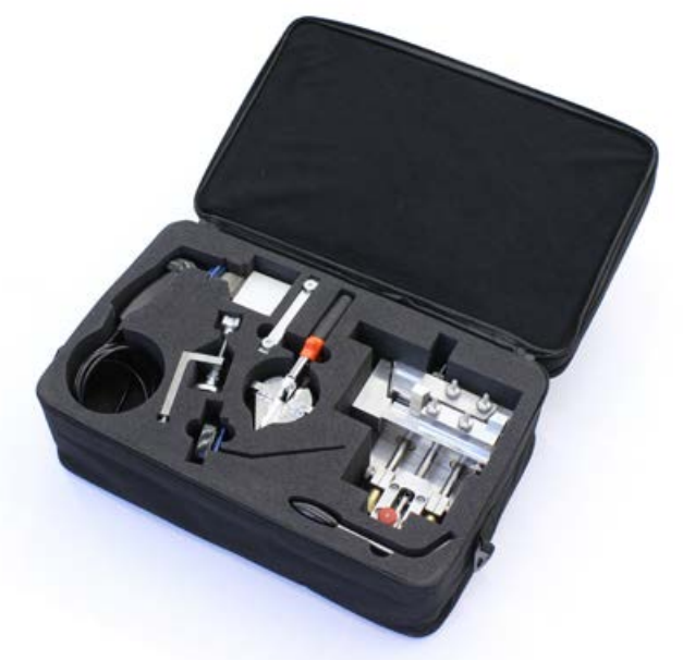
Robust transport case for the overlap welding set FZ03/1.