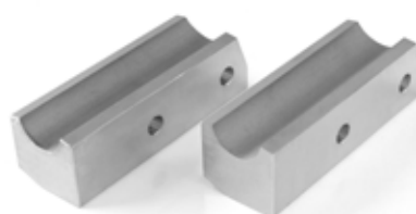
for round belts

In the upper part of the transport bag there is a generally usable space for the side cutter SE02 and free compartments for 9 optional clamping piece pairs.