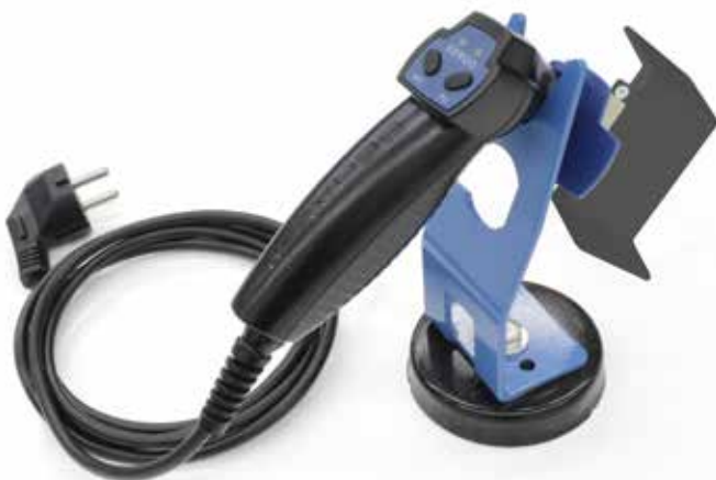
Hot paddle welding tool EErgo with Z-paddle