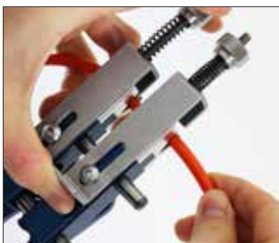
Quick clamp device for inserting the profiles in exchangeable profile jaws.