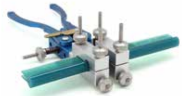
FZ01 Vario with profile jaws for belt edges