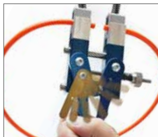
Automatic unlocking starts off lateral pressure.