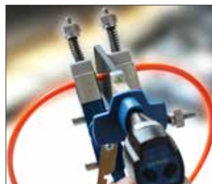
Precise welding thanks to constant pressure.