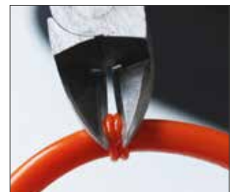
Remove welding bead with side cutter.