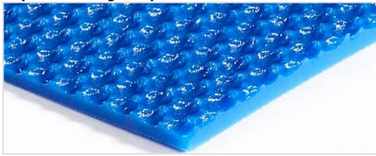
Top side: Rough impression (RI)