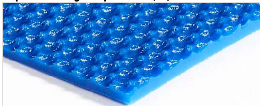
Top side: Rough impression (RI)