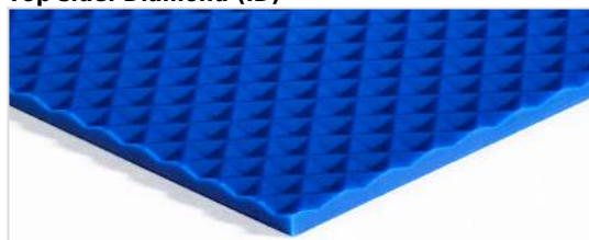
Top side: Diamond (ID)