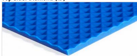
Top side: Diamond (ID)