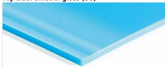
Top side: Smooth gloss (SG)