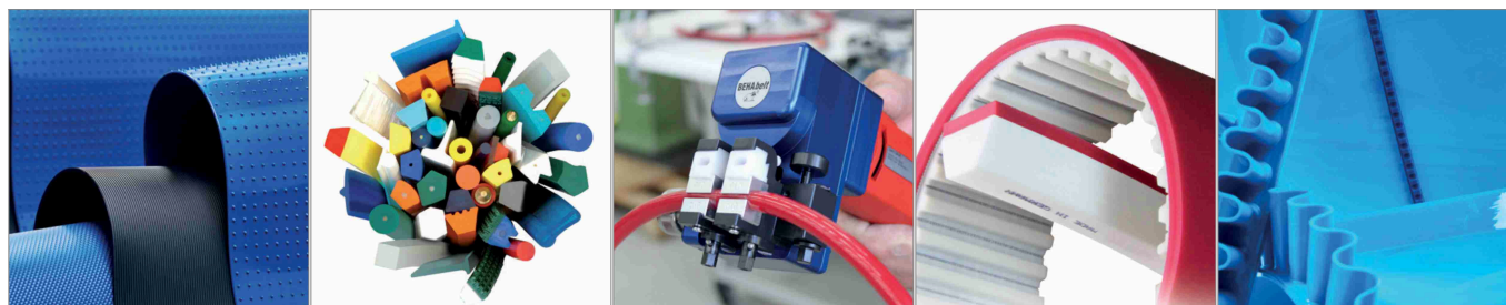
Monolithic conveyor belts made of PU and TPE

Supplementary product solutions as well as welding and joining technology.