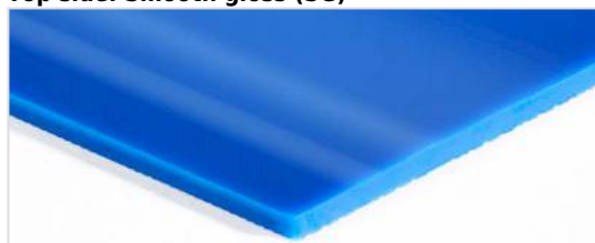
Top side: Smooth gloss (SG)