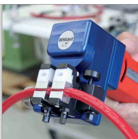
Welding/joining technology for PU and TPE