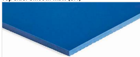
Top side: Smooth matt (SM)