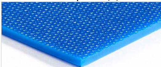
Bottom side: Fabric impression (FI)