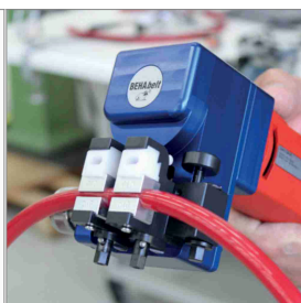
Welding/joining technology for PU and TPE