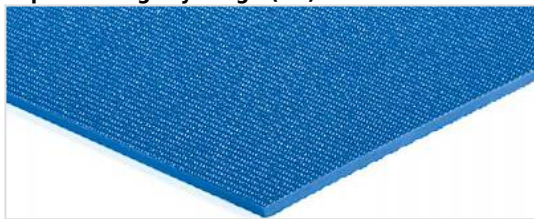
Top side: Slightly rough (SR)