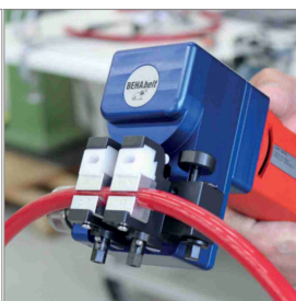
Welding/joining technology for PU and TPE