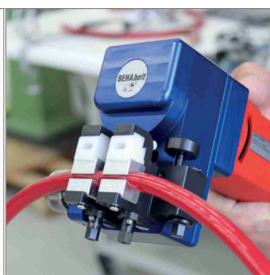
Welding/joining technology for PU and TPE