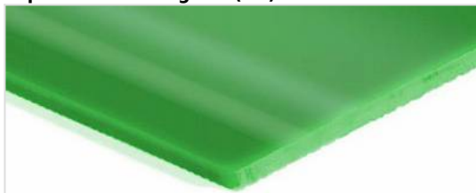
Top side: Smooth gloss (SG)