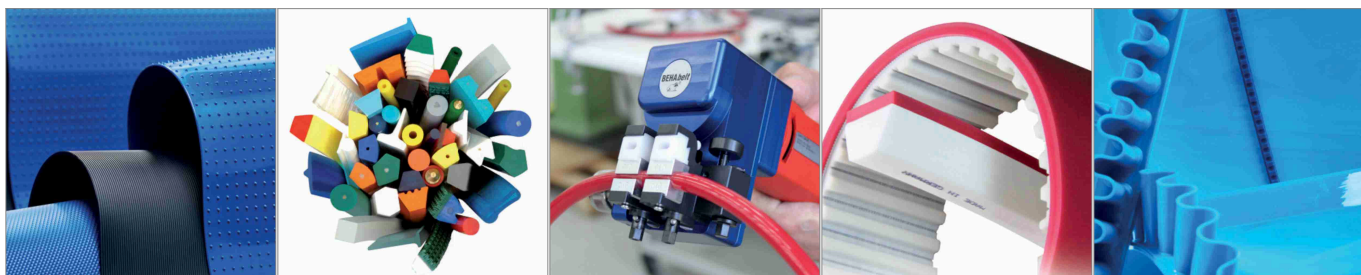
Monolithic conveyor belts made of PU and TPE

Supplementary product solutions as well as welding and joining technology.