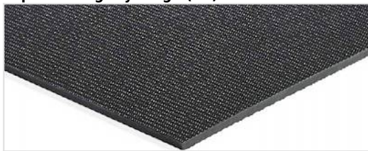
Top side: Slightly rough (SR)