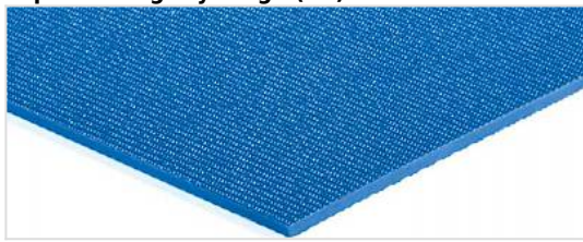
Top side: Slightly rough (SR)