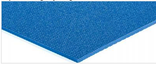
Top side: Slightly rough (SR)