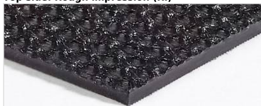
Top side: Rough impression (RI)