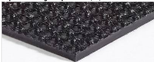
Top side: Rough impression (RI)