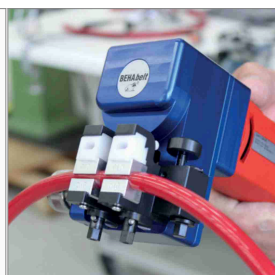
Welding/joining technology for PU and TPE