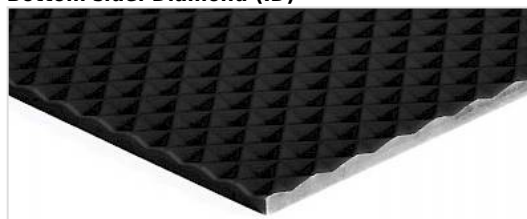
Bottom side: Diamond (ID)