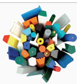
Weldable belts made of PU and TPE