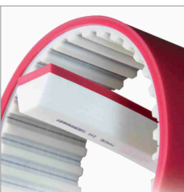
PU coatings for toothed and V-belts