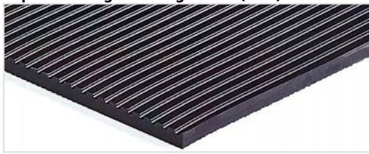
Top side: Longitudinal grooves (LGB)