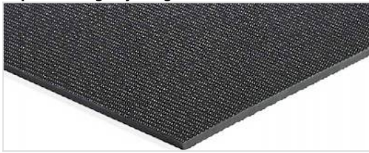
Top side: Slightly rough (SR)