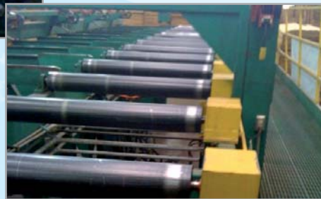
Roller conveyors with BEHAbelt Round belts PU 85 A PLUS

For small pulleys PU 75 A PLUS is available on inquiry.